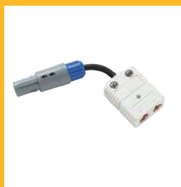
Universal Thermocouple Adapter