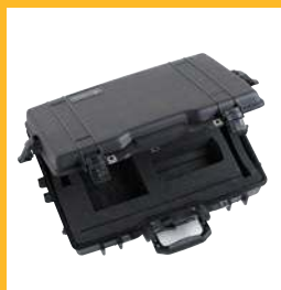
Probe and Readout Case