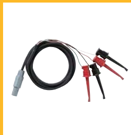
Universal RTD Adapter