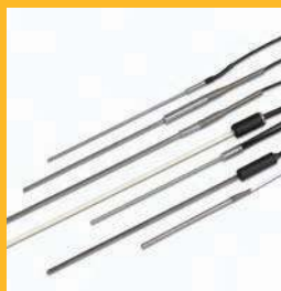
Calibrated Temperature Sensors

A wide array of accessories is available to help you maximize productivity, but the following are essential for most users.