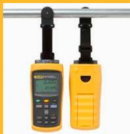
TPAK Meter Hanging Kit